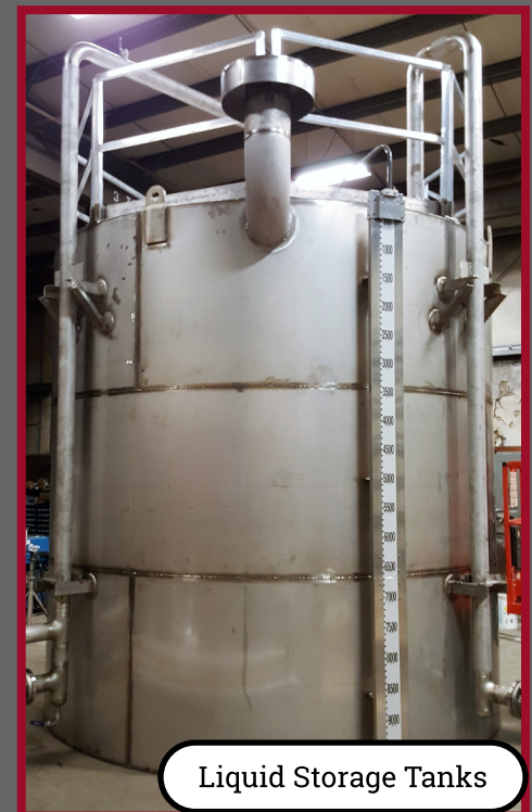
Liquid Storage Tanks